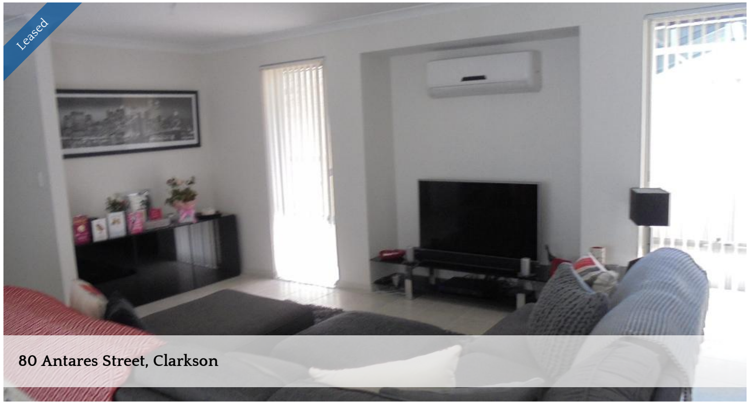
80 Antares Street, Clarkson