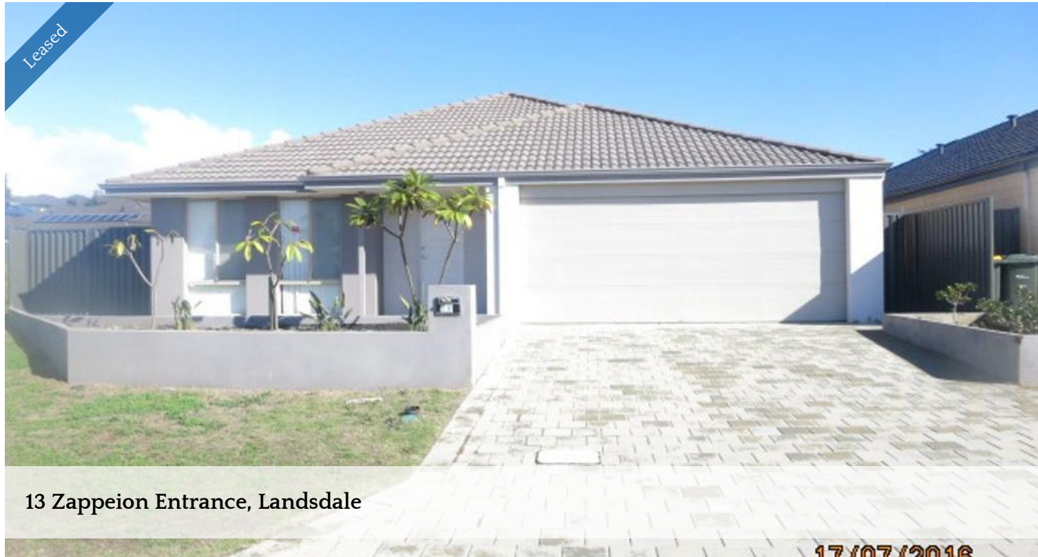
13 Zappeion Entrance, Landsdale