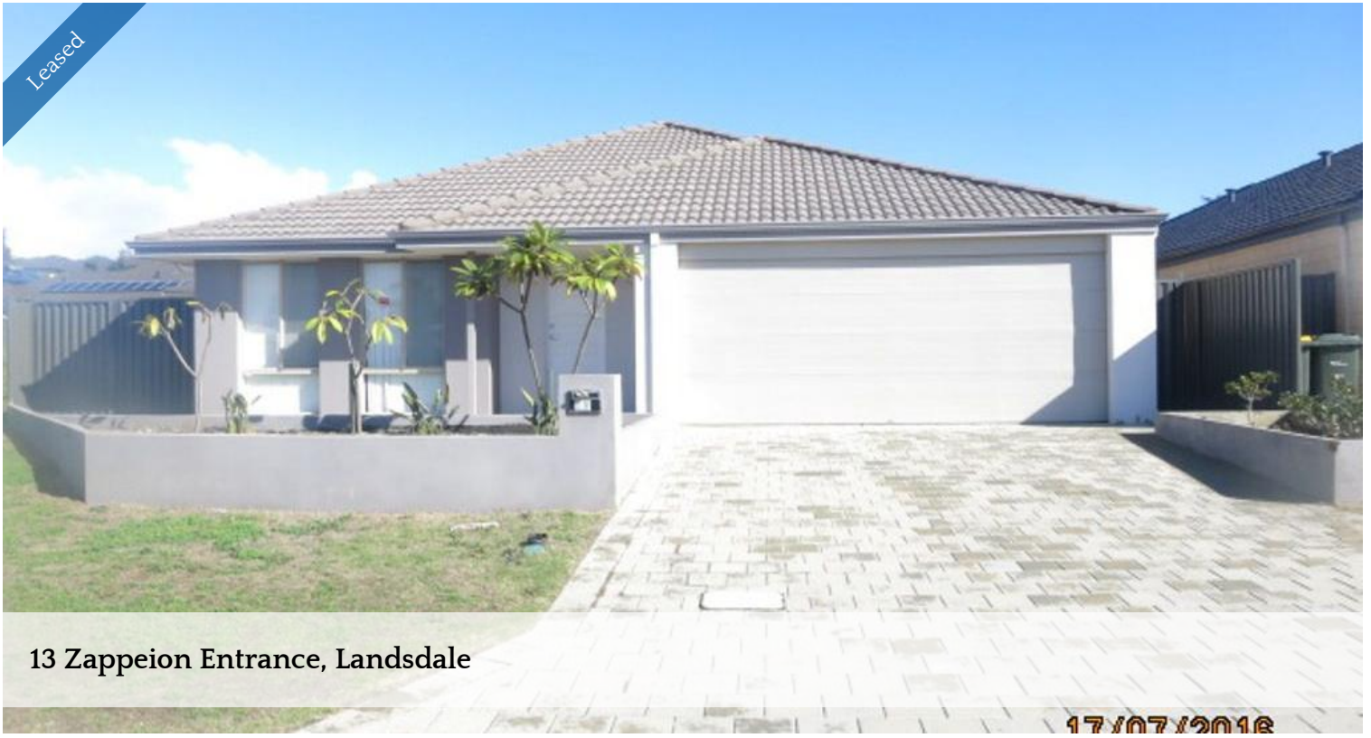
13 Zappeion Entrance, Landsdale