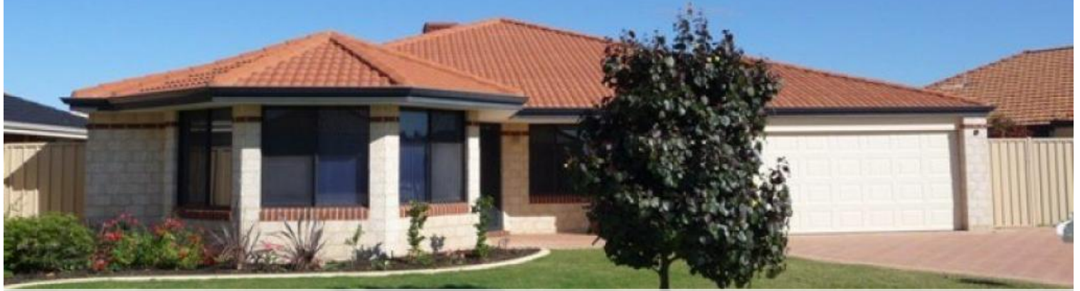
Lot 3 Macdermott Parade, Darch