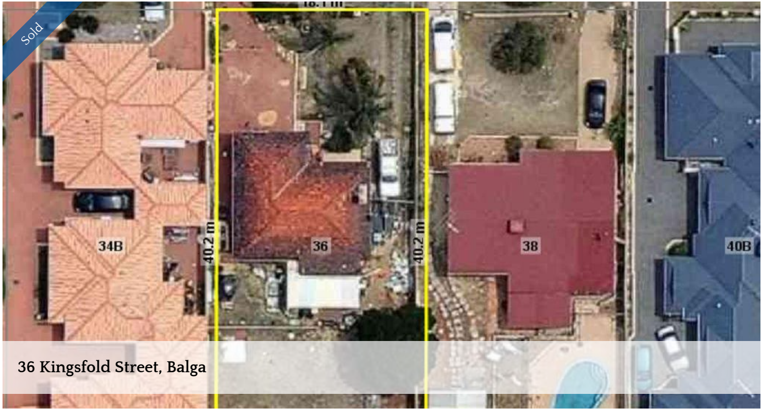
36 Kingsfold Street, Balga