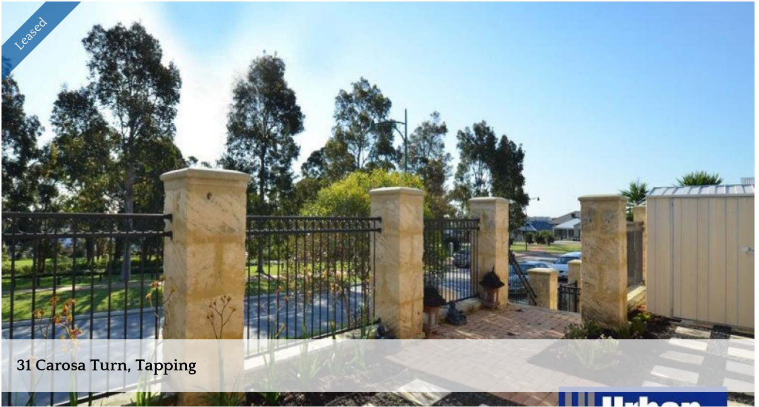
31 Carosa Turn, Tapping