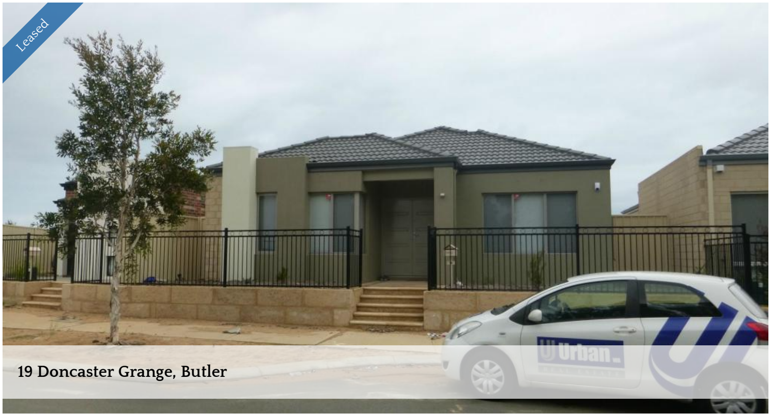
19 Doncaster Grange, Butler