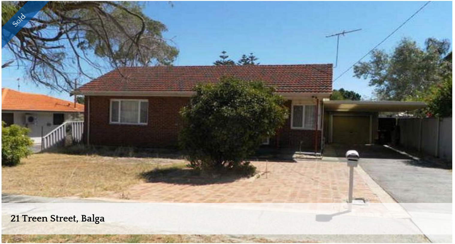
21 Treen Street, Balga