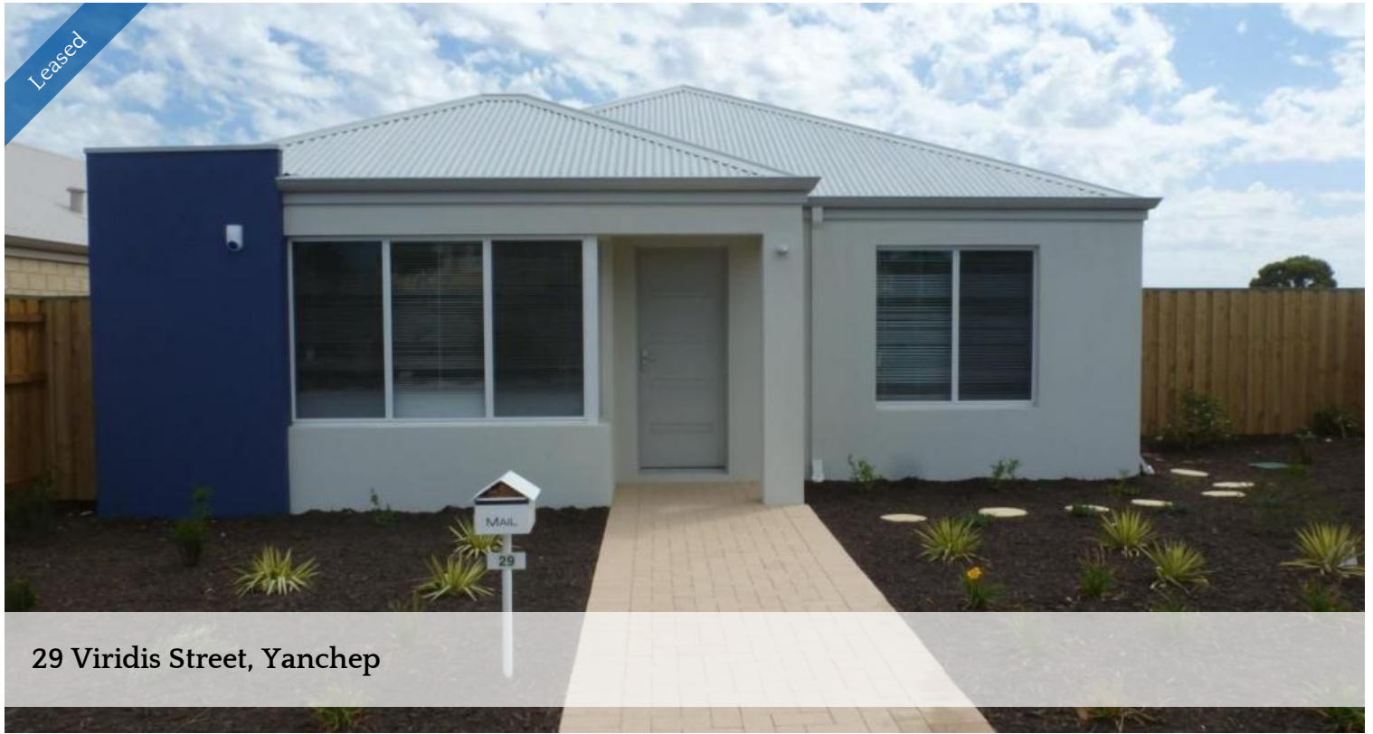
29 Viridis Street, Yanchep